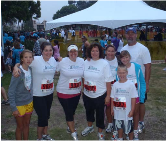
Pre dawn for the 5K