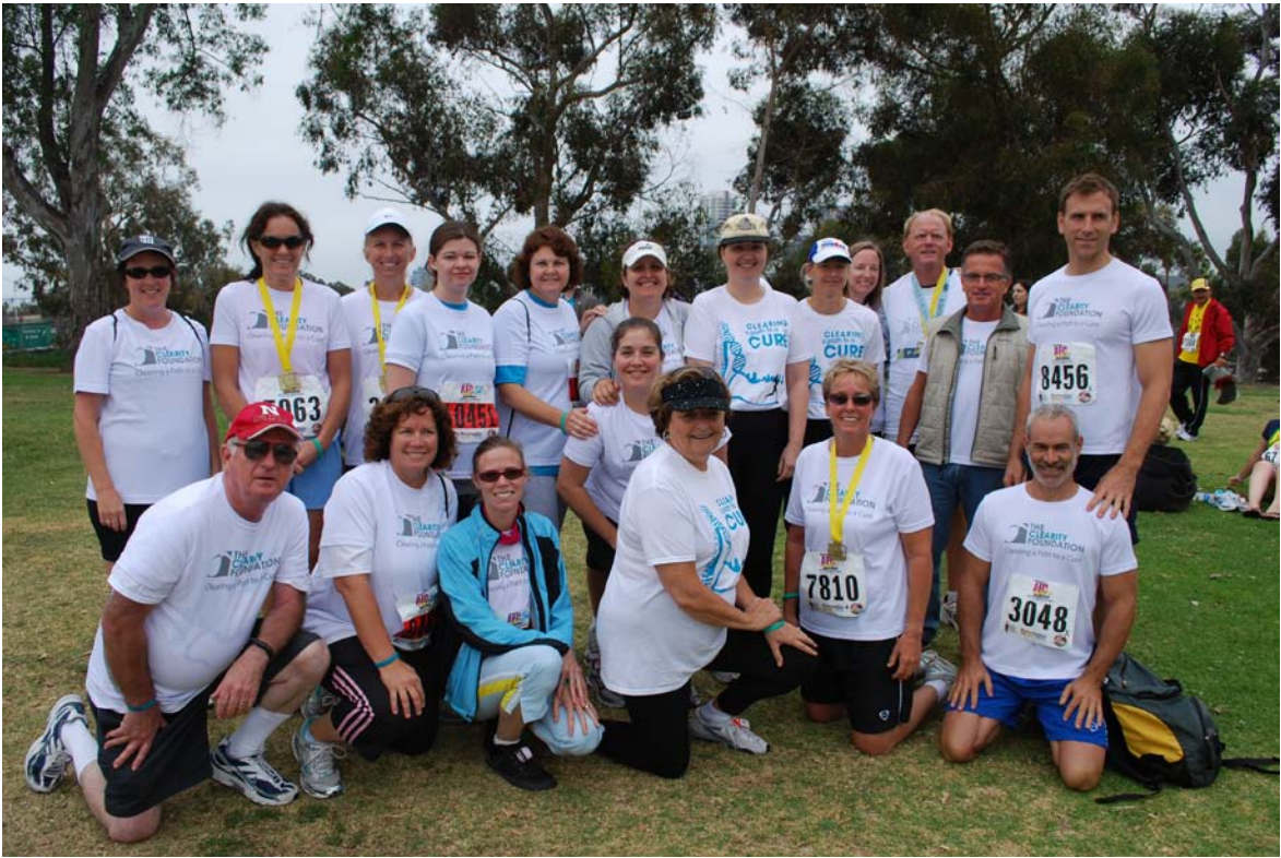
Ovarian Cancer Cures TODAY!